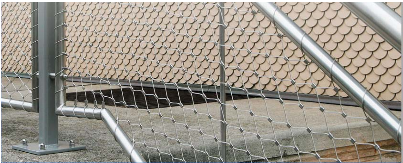
Mesh to be used on stair railings, not on arched section atop bridge