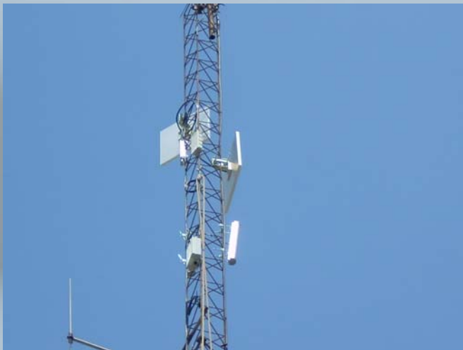
Fire Station #2